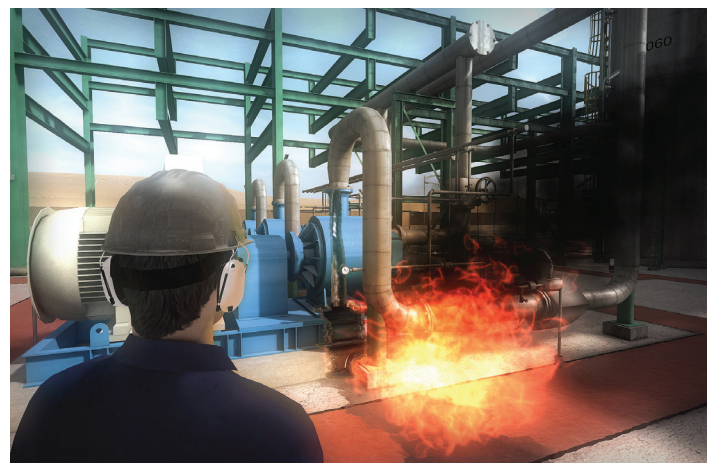
Emergency preparedness training in a VR environment