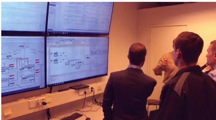
Oulu students see textbook theories applied in the pilot plant