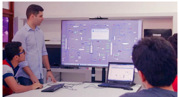
UFCG prepares students for new technologies